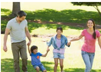
【 walk in the park with their children / every Sunday 】

Teacher : What do the Joneses like to do?