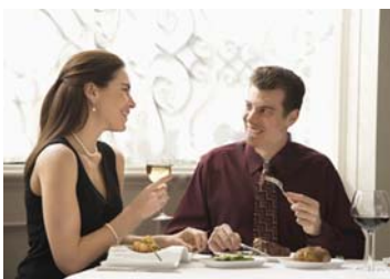
【 eat French food / his girlfriend 】

Teacher : What does Mr. Smith like to do?