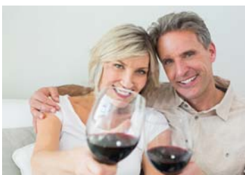
【 wine / home 】