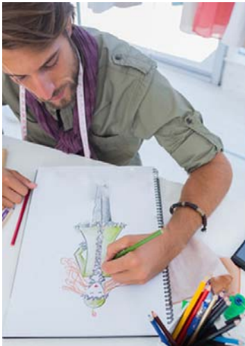
【 sketch designs / his office 】